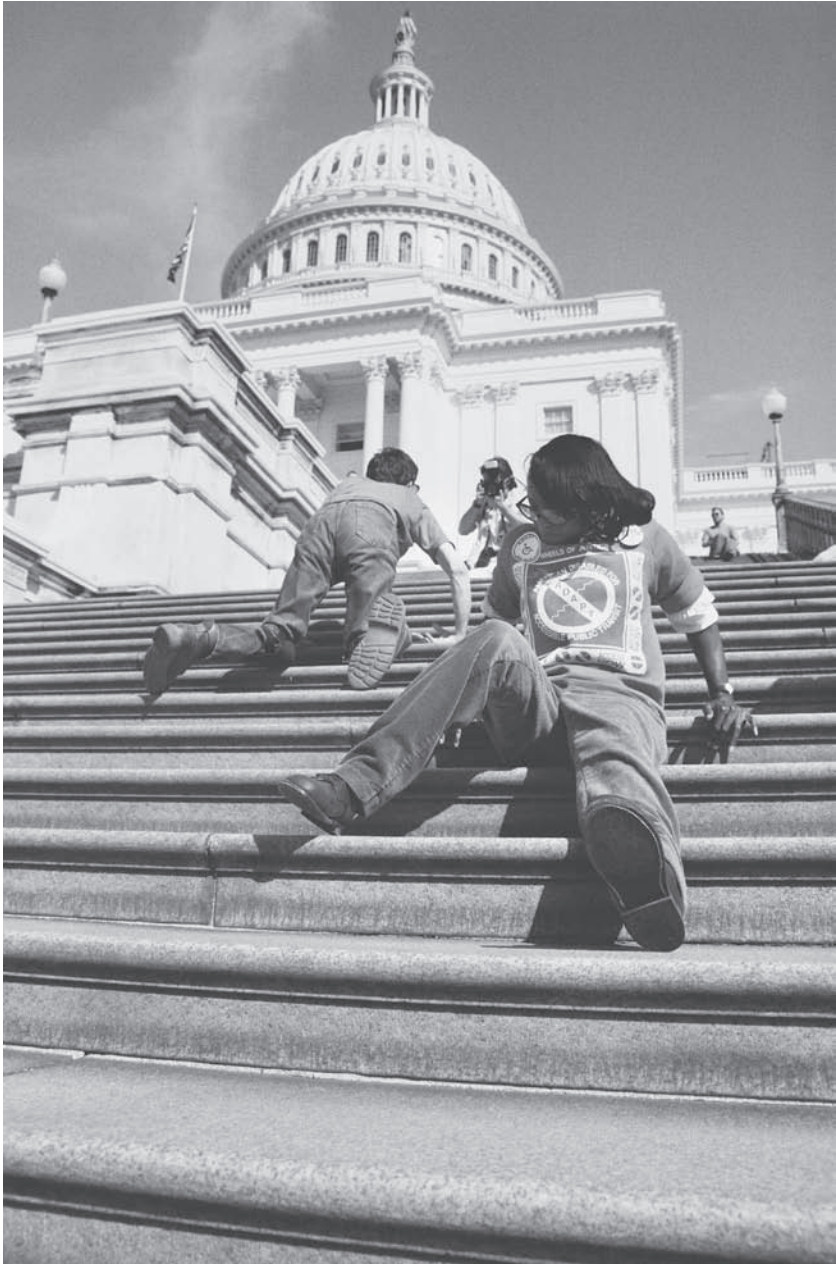
Fig. 2. Tom Olin, “Day in Court for Americans with Disabilities Protests Planned over Supreme Court’s ADA Rulings.” March 1990. Reprinted with permission.