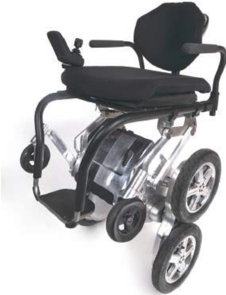
Fig. 4. The iBot Climbing Wheelchair. Toyota Corporation.

Take for example the notion (from a recent Vice article) that we should “Repair Disabilities, Not Sidewalks,” or this image of the iBot Climbing Wheelchair: