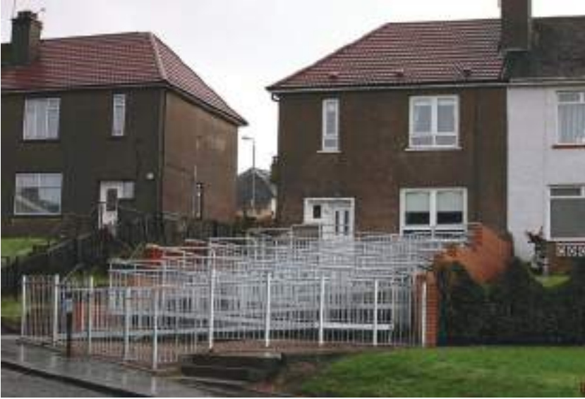
Fig. 5. “Katie Lalley’s Access Ramp.”

As with the example of the “defeat device,” altogether too many retrofits preserve or perpetuate exclusion rather than address it. They are about covering your ass, legally—not about creating anything like real access.