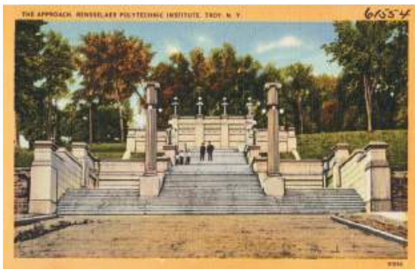
Fig. 1. “Postcard: Approach to Rensselaer.” Rensselaer Polytechnic Institute Library Archives, 1910.

tinue to climb up to an imposing set of gates. Behind these gates there are green trees and foliage and, we assume, the university. Five people stand up near the very top of the steps and they look very small, giving perspective on just how steep and massive the approach is.